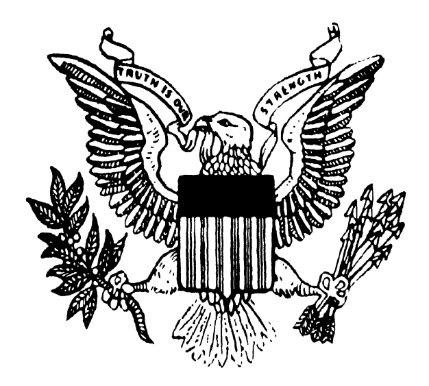
THE DEPARTMENT OF STATE OF THE UNITED STATES OF AMERICA